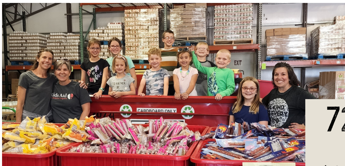
Pictured above: 3 Hours + 3 Adults + 11 Kids (2 not pictured) = 1,000 bags packed for the community!